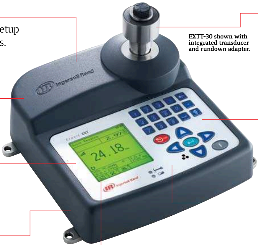
EXTT-30 shown with integrated transducer and rundown adapter.

Compact and lightweight with rechargeable battery provides ease of use and portability on the assembly line and space savings on the workbench.