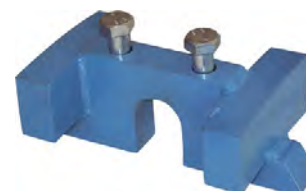
Bridge with screws